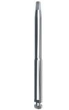
Hexagon screwdriver 1.25 mm, long, with contra-angle connection Art. no. 55564