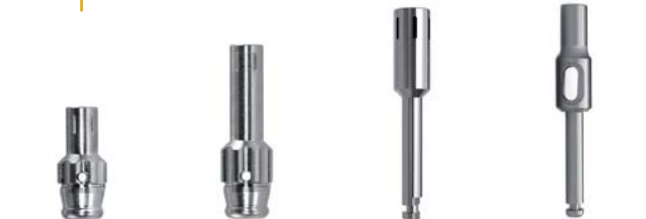
Insertion tool for implants, short, with ratchet connection Art. no. 55831