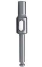
Drill extension, one-piece, long, without internal cooling Art. no. 55761