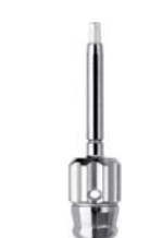
Hexagon screwdriver 1.25 mm, long, with ratchet connection Art. no. 55948