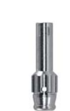
Insertion tool for implants, long, with ratchet connection Art. no. 55830