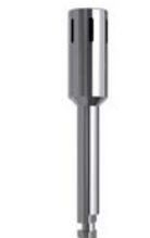
Insertion tool for implants, short, with contra-angle connection Art. no. 56990