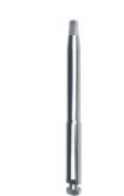
Hexagon screwdriver 1.25 mm, short, with contra-angle connection Art. no. 55563