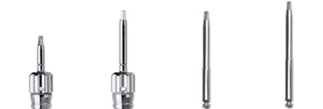
Hexagon screwdriver 1.25 mm, short, with ratchet connection Art. no. 53949